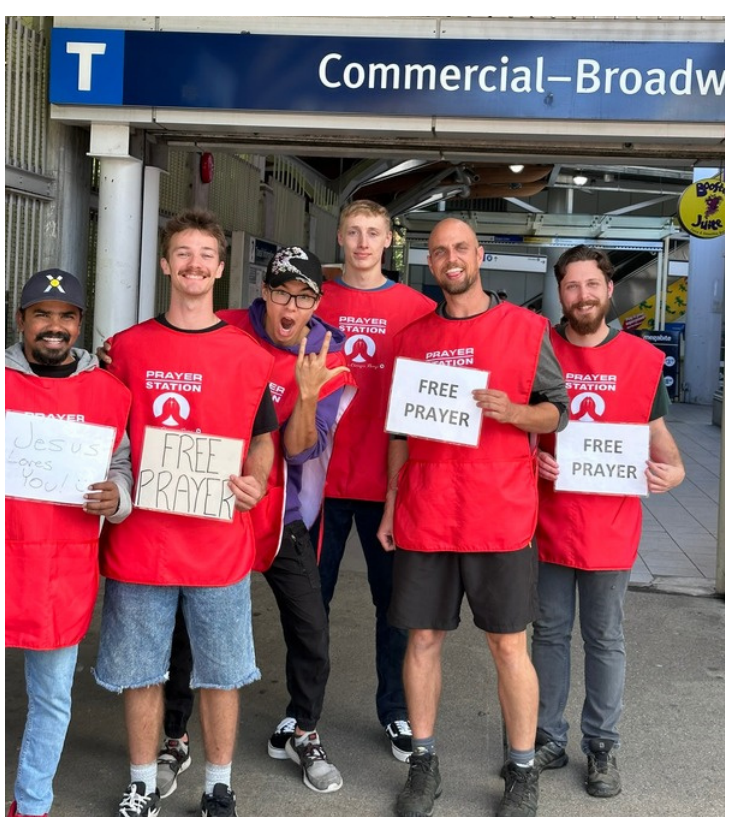
Prayer station team