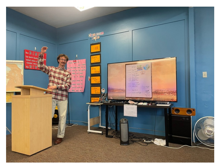
Delivering my final presentation